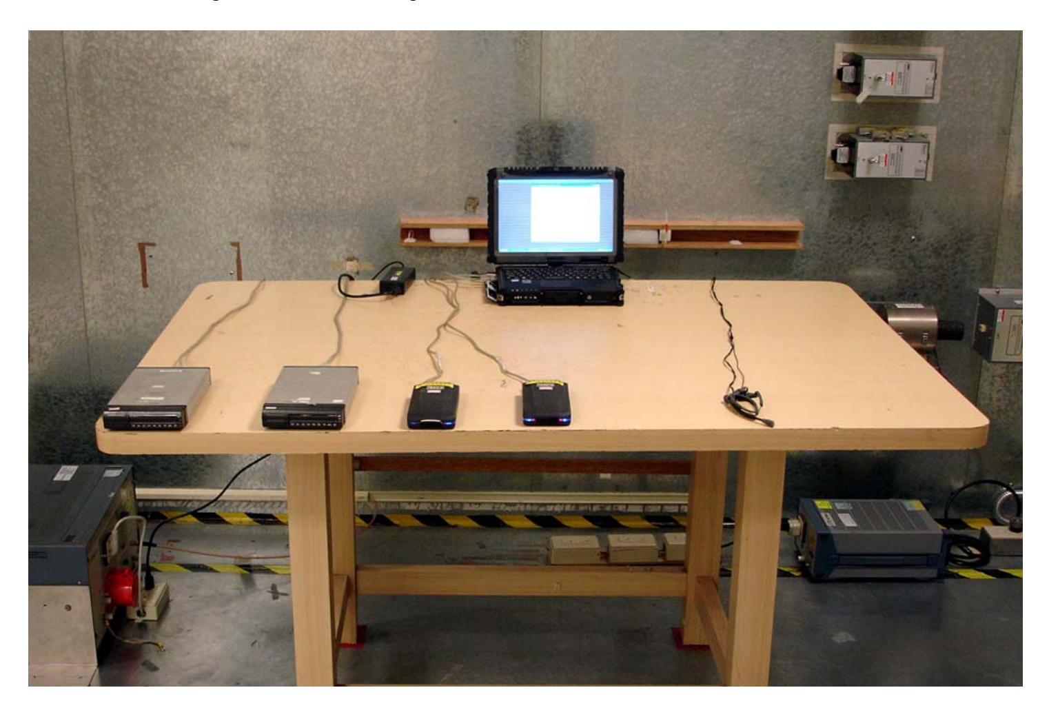
The Front View of Highest Conducted Set-up For EUT