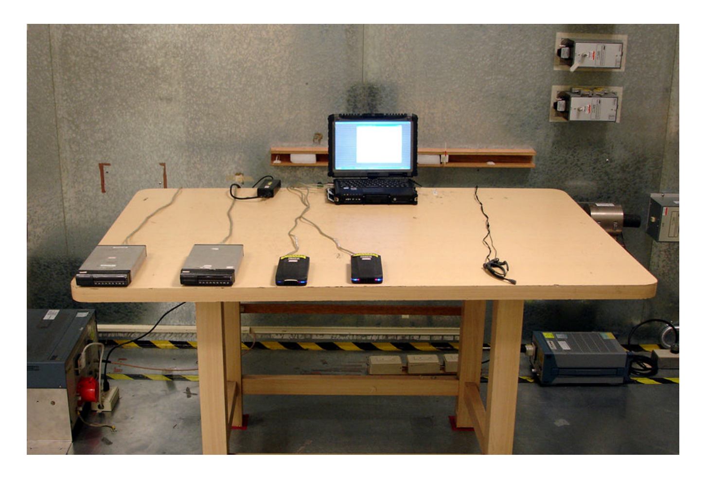
The Front View of Highest Conducted Set-up For EUT