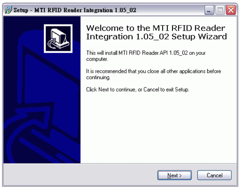
Fig. 2 Start the setup wizard.

43-RFID INTEGRATION UG105 DATE: 12/13/2006