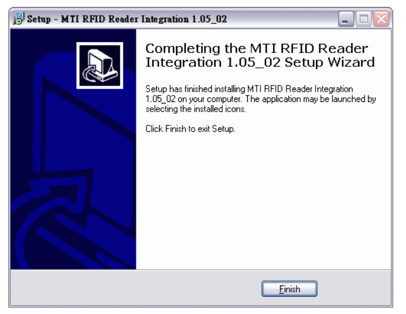
Fig. 6 Finish the installation.

43-RFID INTEGRATION UG105 DATE: 12/13/2006