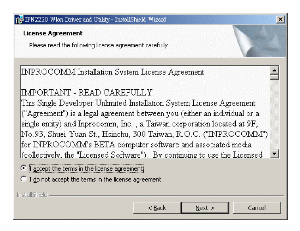
Figure 1. License Agreement Dialog