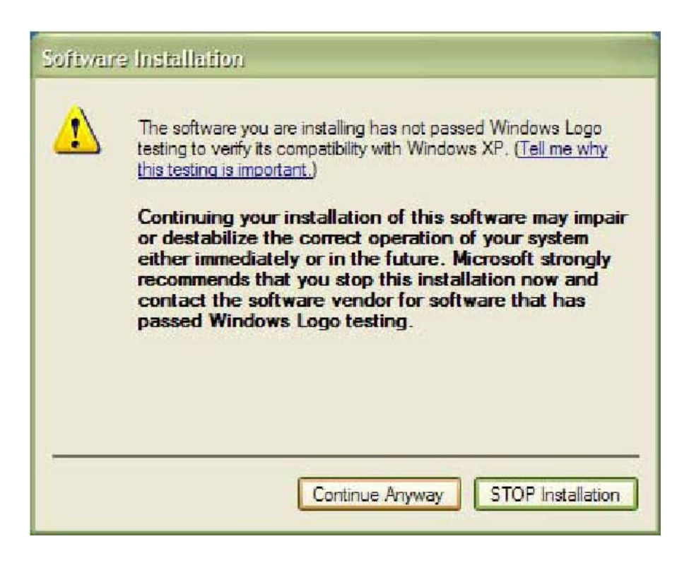
Figure 4. Windows Digital Signature Warning

5. Click "Finish" to complete driver installation.