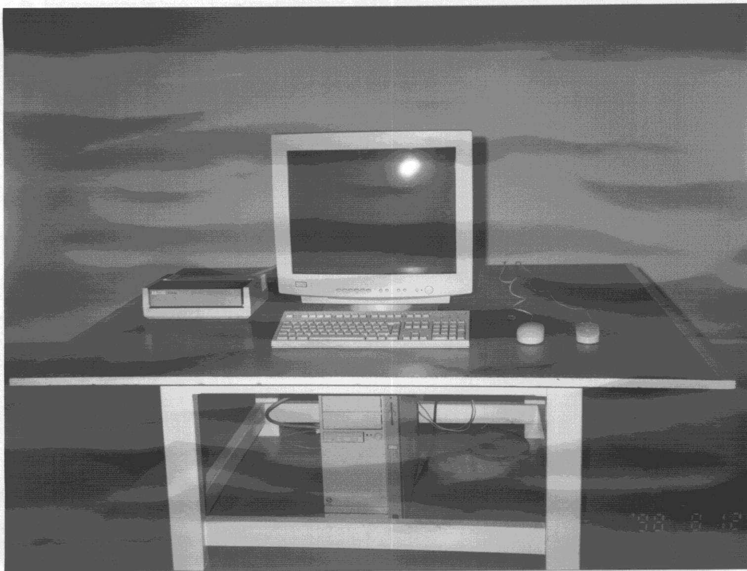
Photograph No. 16: Test set up for the measurement of Radiated Disturbances