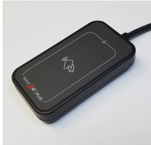
Wave ID ® Plus Reader