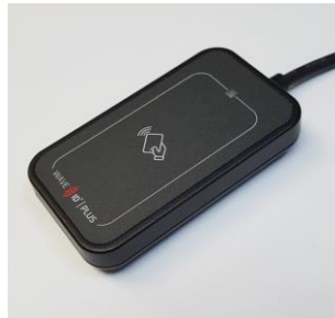
Wave ID® Plus Reader