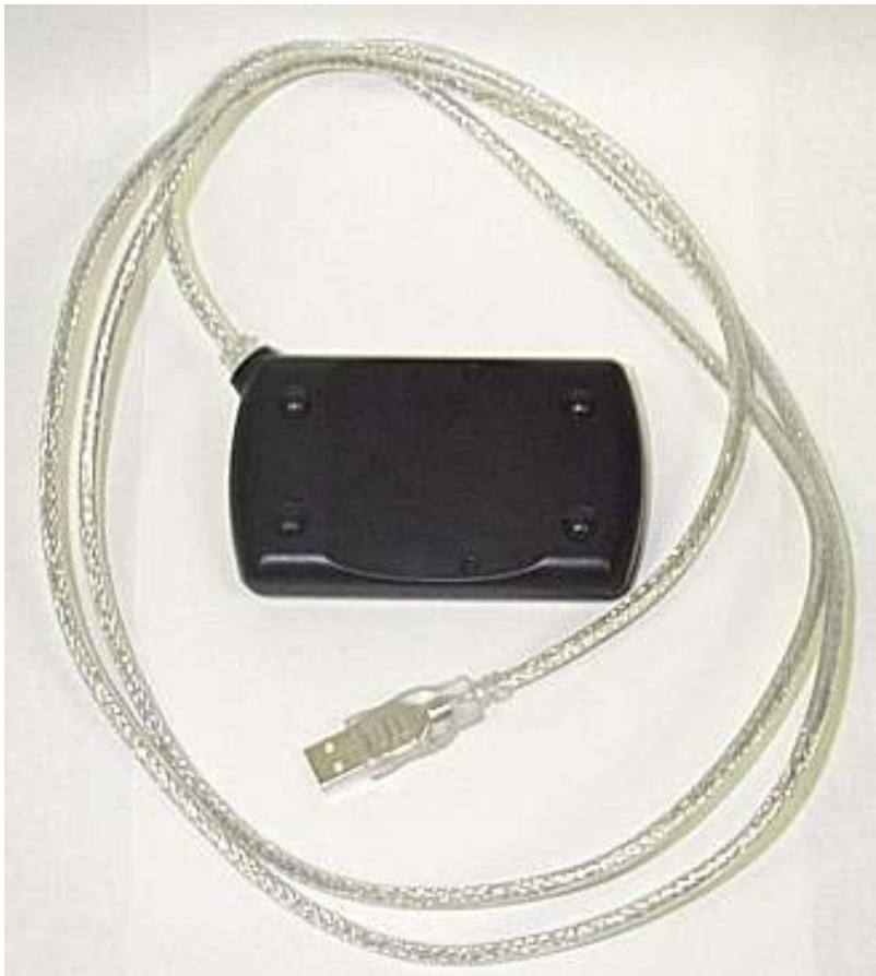
Rear of EUT