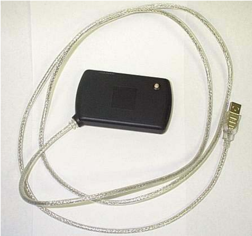
Front of EUT