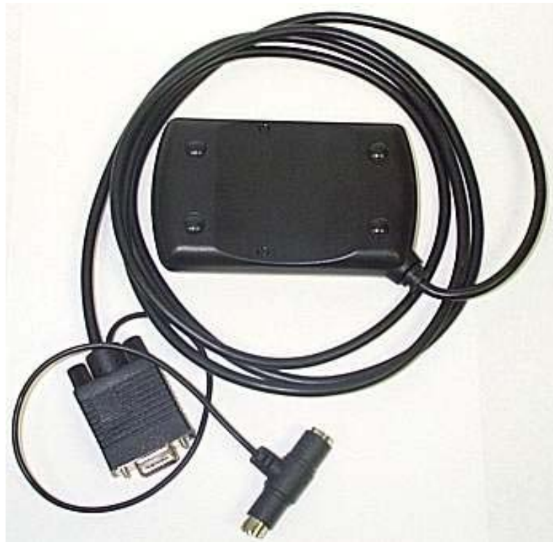
Rear of EUT