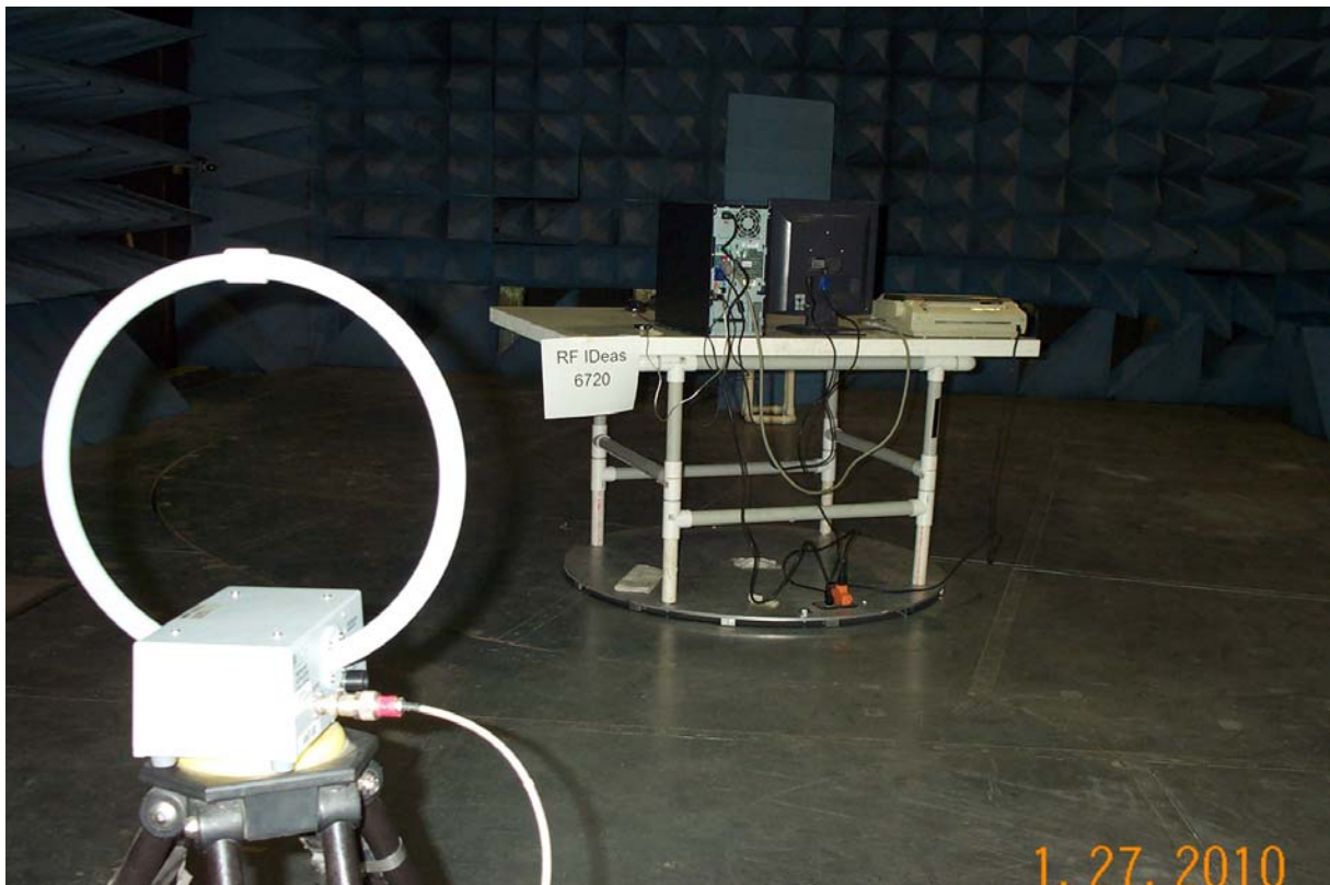
Magnetic Field (below 30 MHz)