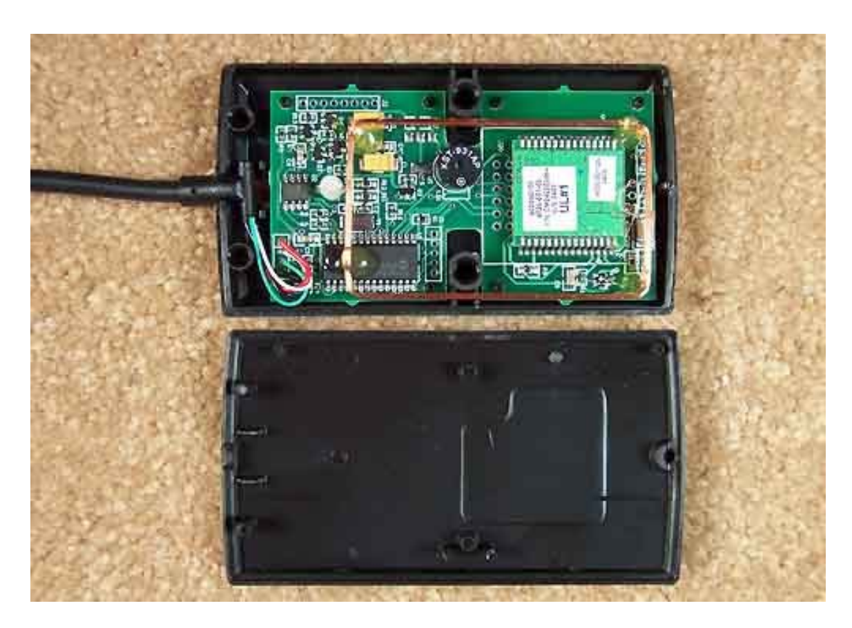
Inside Front Cover