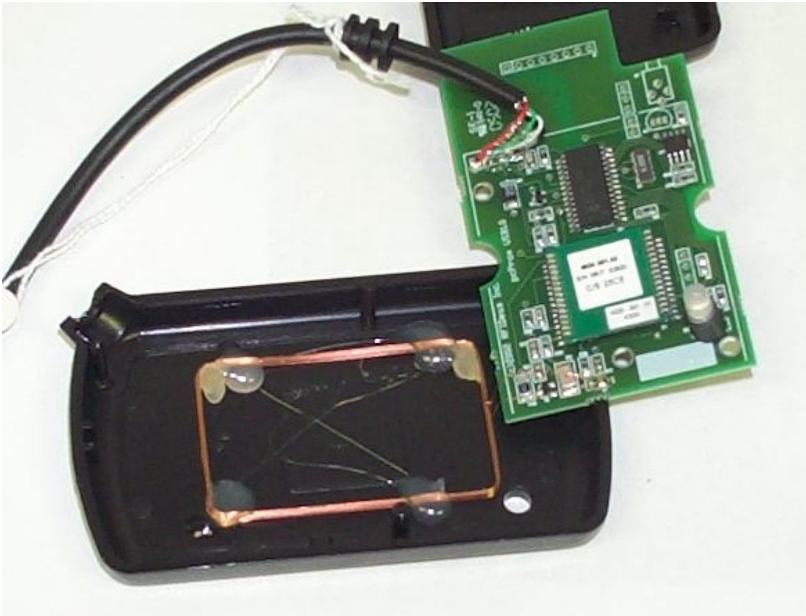
Circuit Board showing connection to inside cover