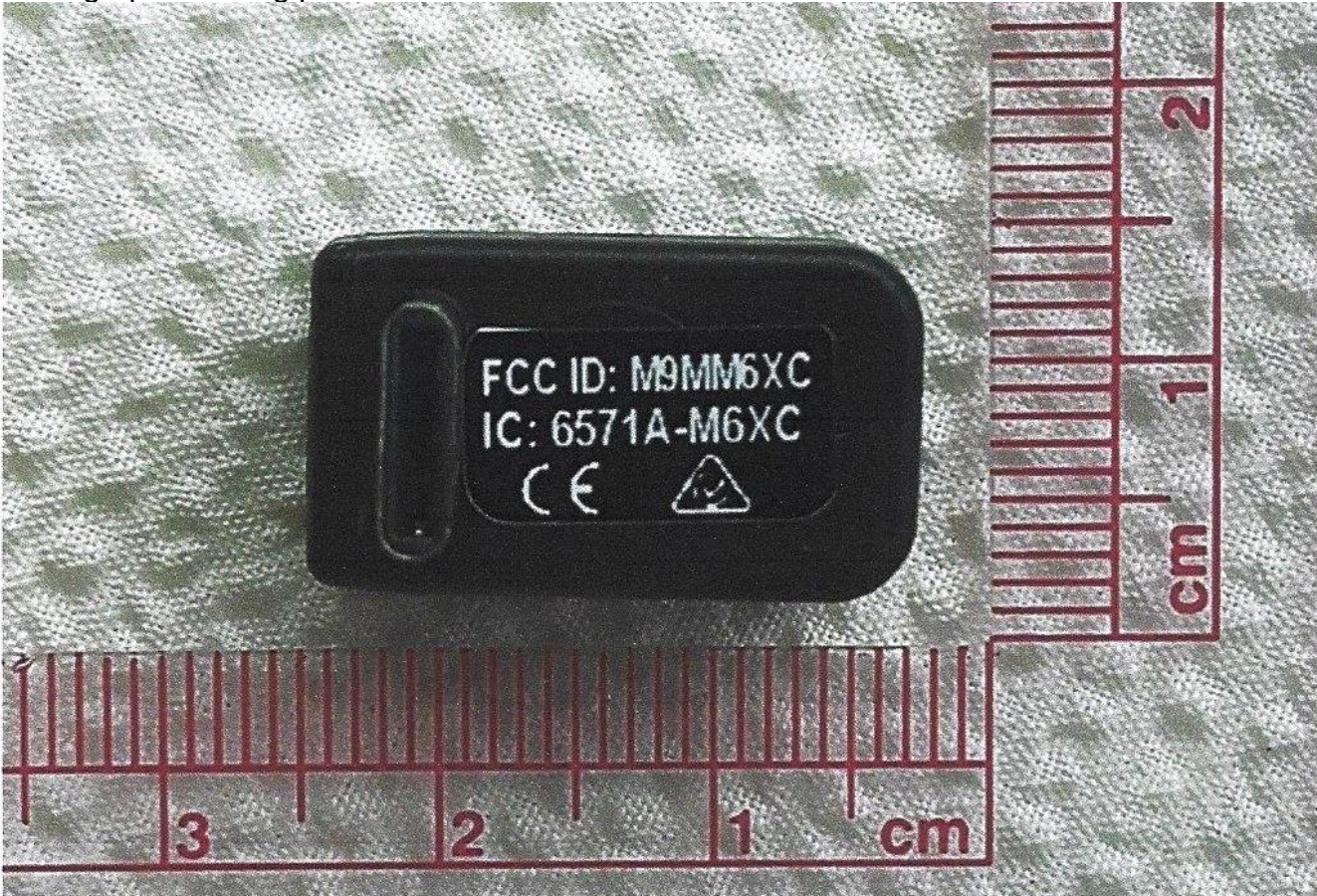
Photograph showing placement of label