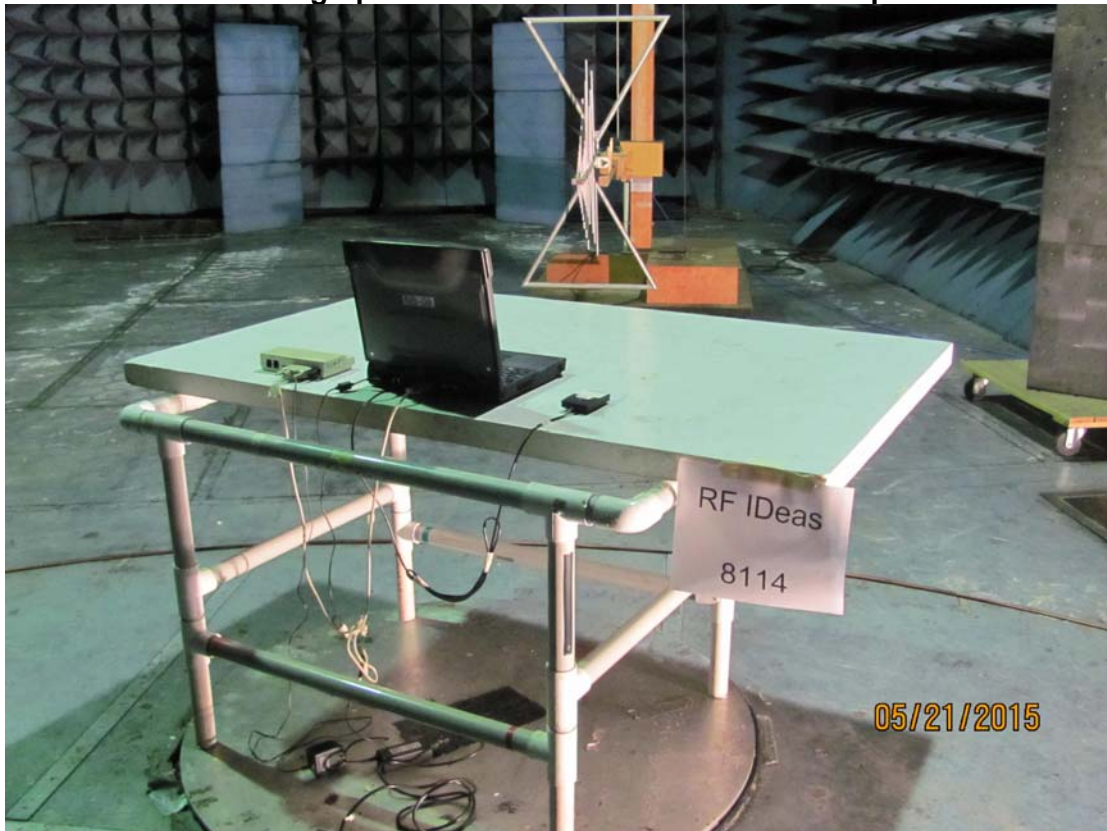
30 to 1000 MHz