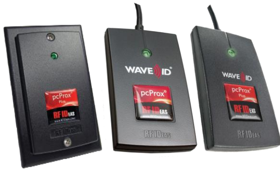
RF IDEAS pcProx® and pcProx® Plus Readers