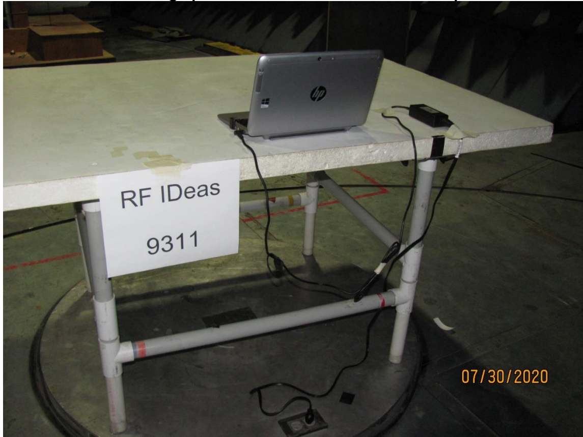
H-field 0.01-30 MHz