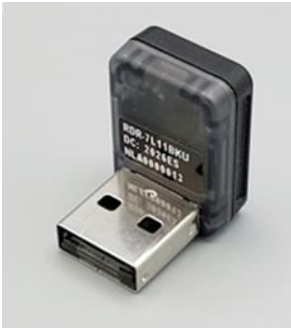
Wave ID ® Legic Nano USB Reader