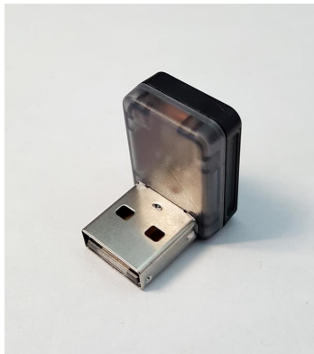
RF IDEAS pcProx® Reader