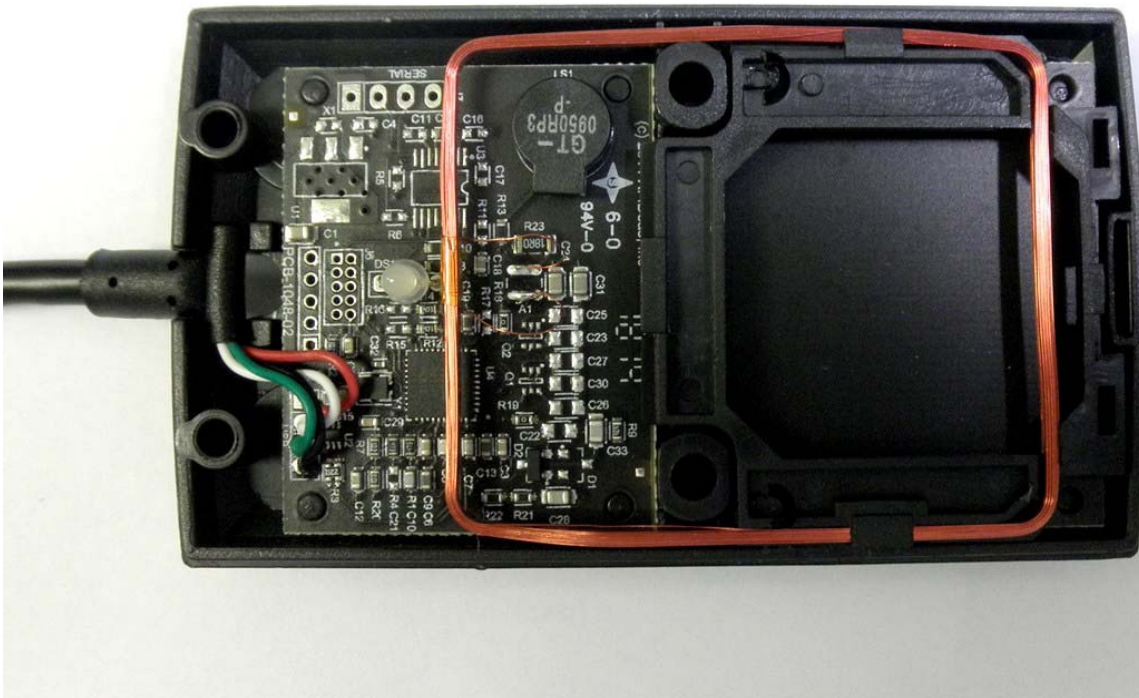
Photograph of PC Board: Component Side