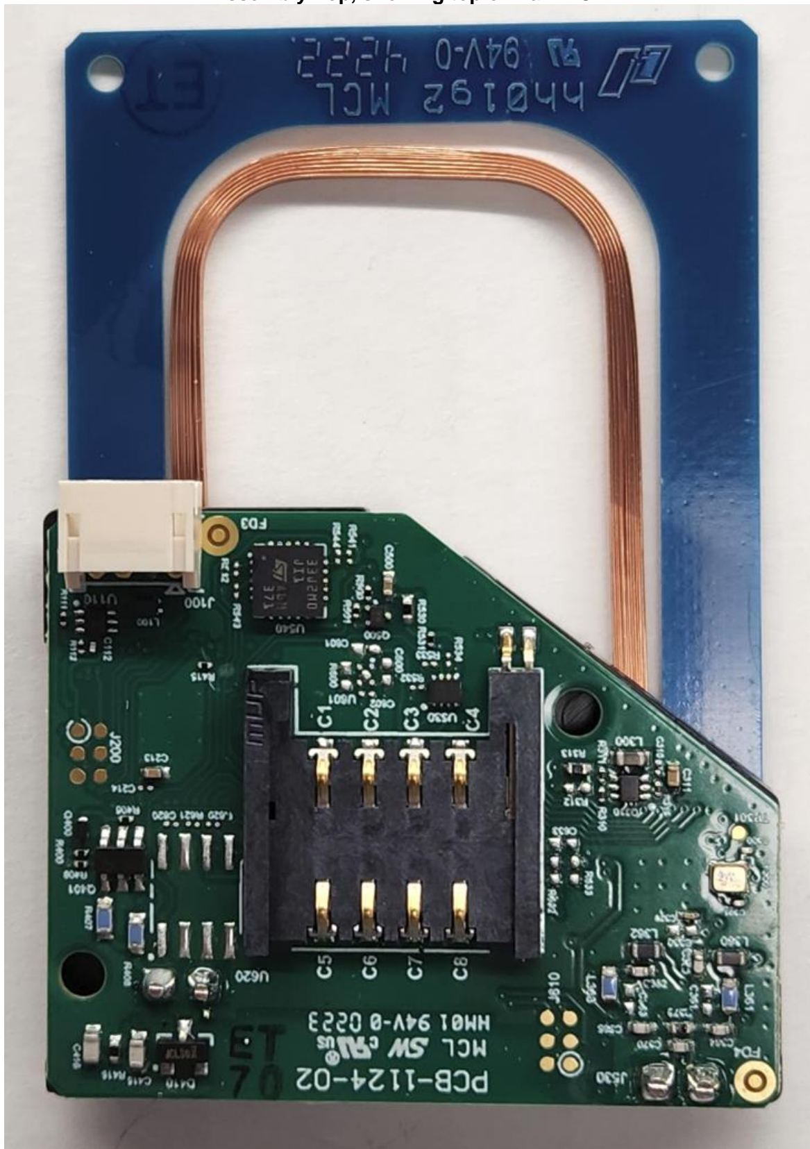
Assembly Top, showing top of Main PCB