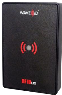
Wave ID ® Plus Reader