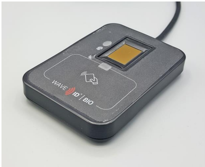
Wave ID® Fingerprint Black USB Reader