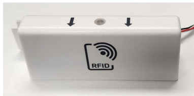
Wave ID ® Plus Reader