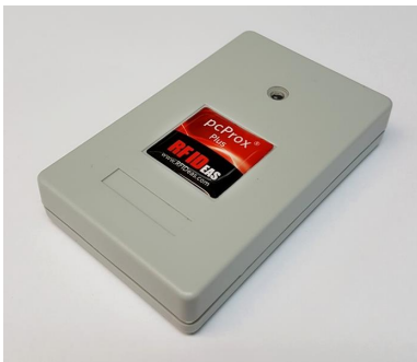
Wave ID ® Plus Reader