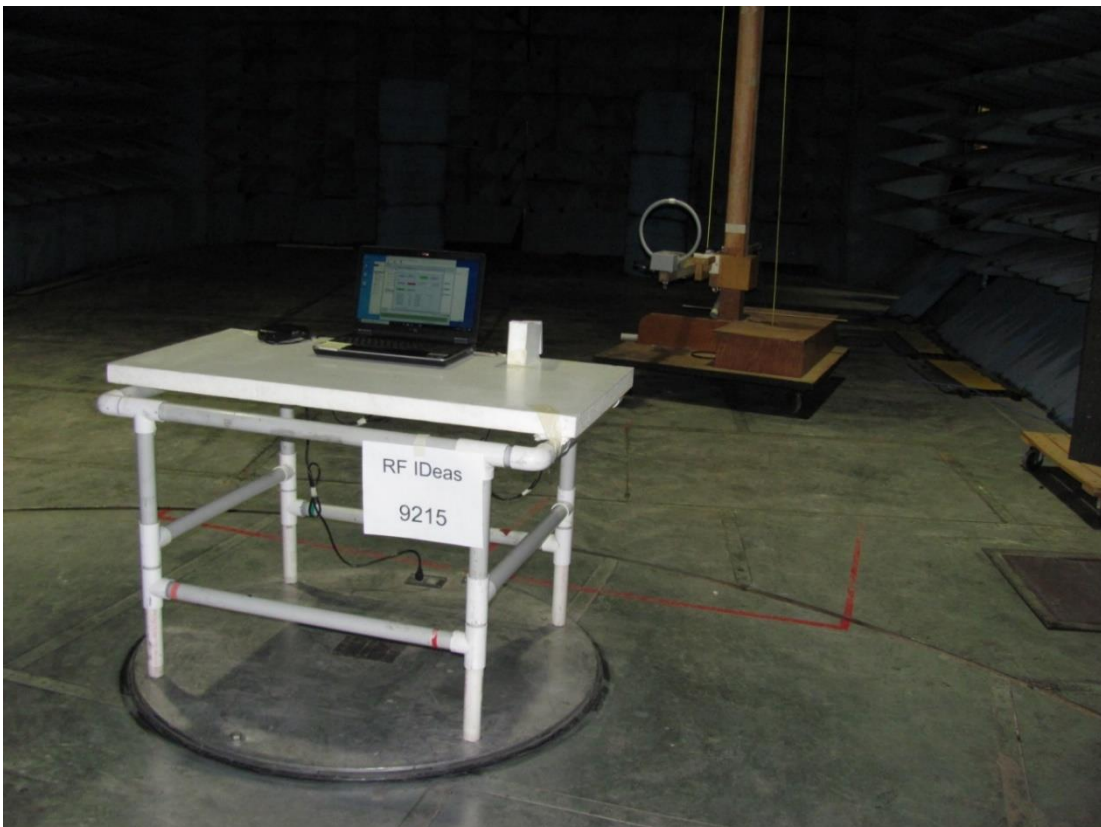
H-field 0.01-30 MHz