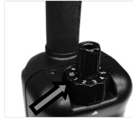
FIG. 1—Turn Dial to #1

NOTE: LED light on Remote will be Red for Vibration mode, and Green for Tone mode.