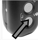
FIG. 2 –Press V/T 2 times- Holding 3 Sec. on 2nd press