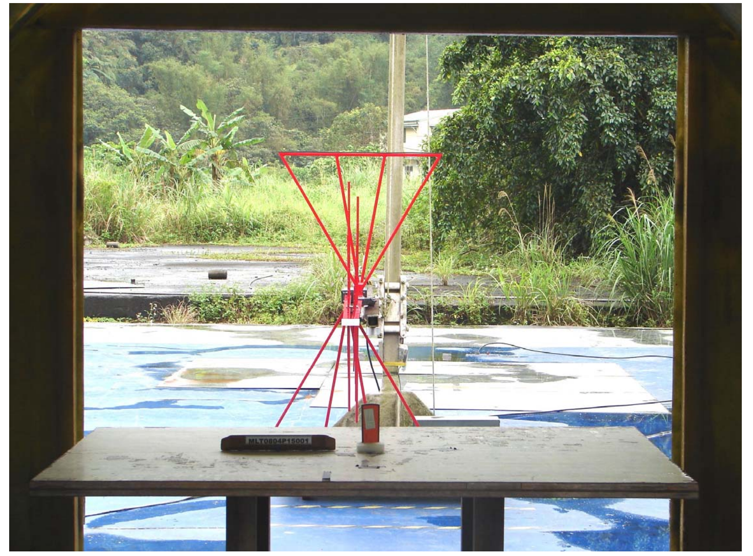
Rear View of The Test Configuration