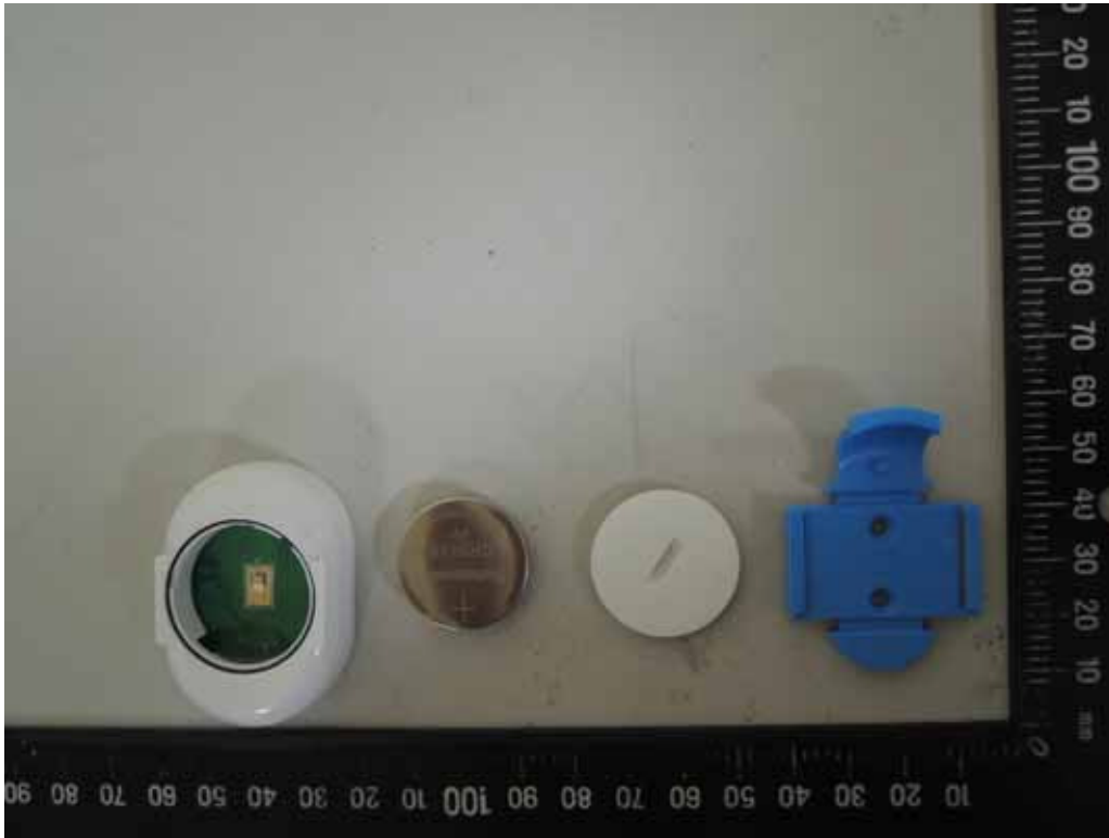
Open View of EUT-2