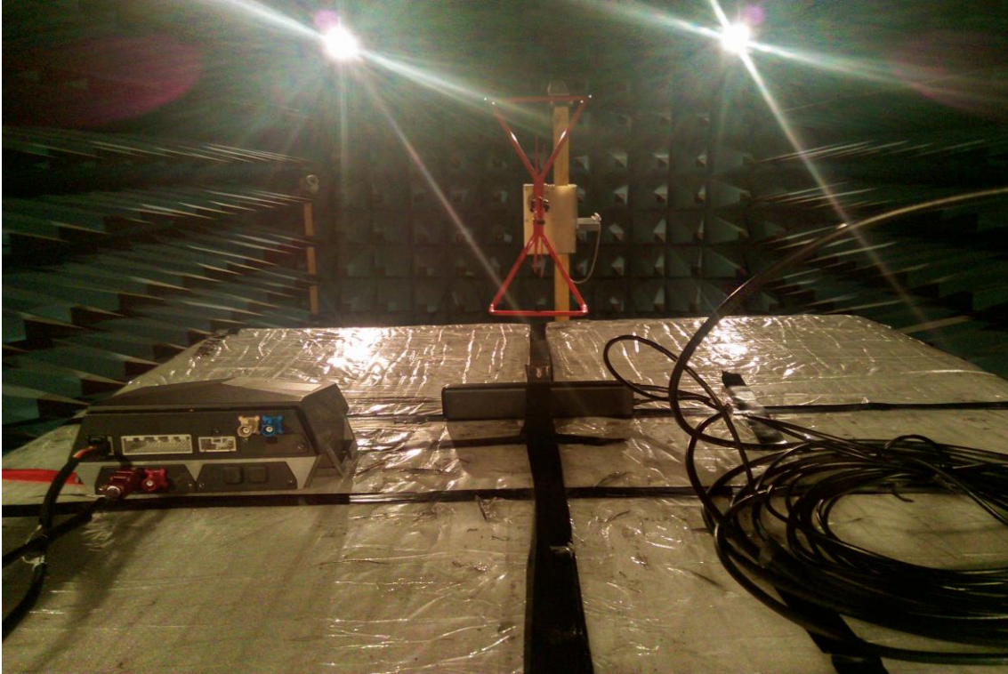
WCDMA Band V

Radiated Emission Set up Photos Below 1GHz WCDMA Band II