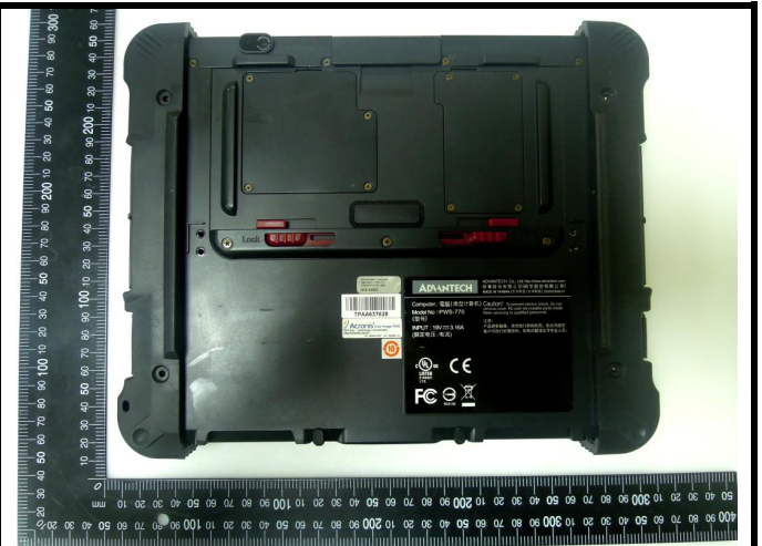
EUT – Rear View