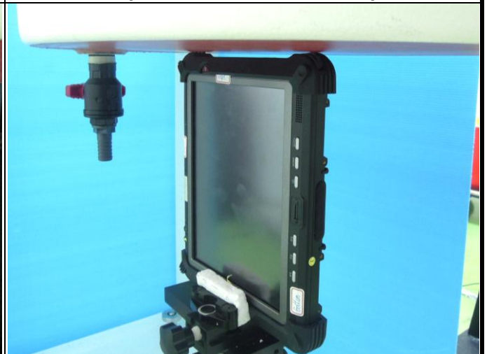
Right Side of EUT with 0 cm Gap