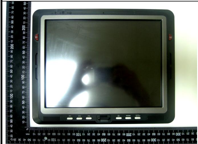
EUT Remove Bumper – Front View