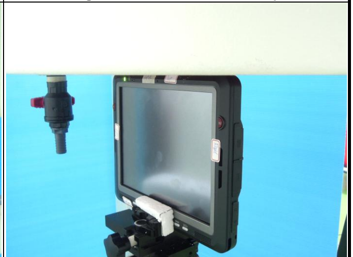
Top Side of EUT (Removed Bumper) with 0 cm Gap