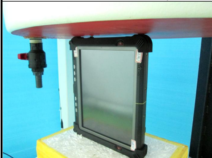
Left Side of EUT with 0 cm Gap