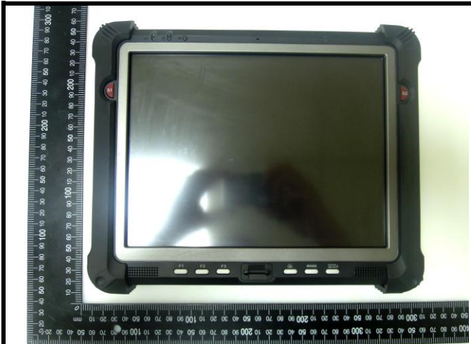
EUT – Front View