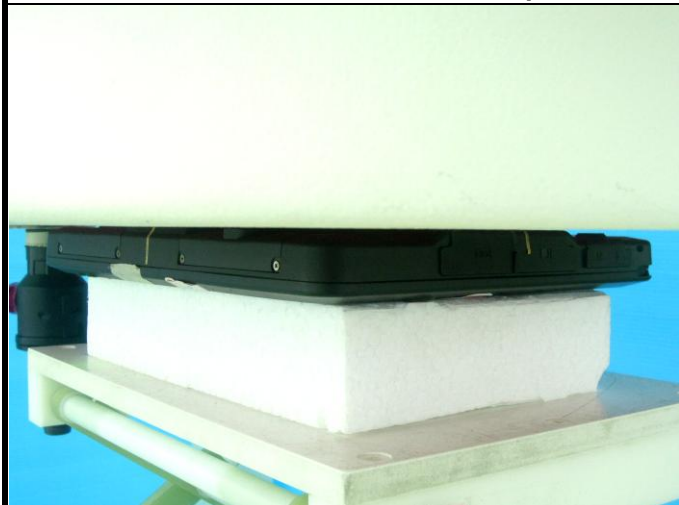
Rear Face of EUT (Removed Bumper) with 0 cm Gap