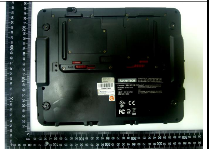
EUT Remove Bumper – Rear View