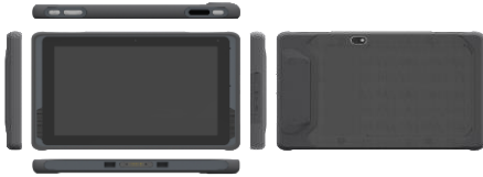
Left: Front View