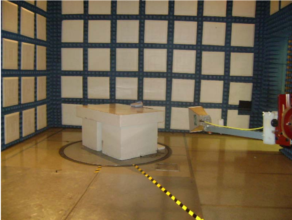
Test Setup for Radiated Emissions, Above 1GHz – Horizontal Polarization