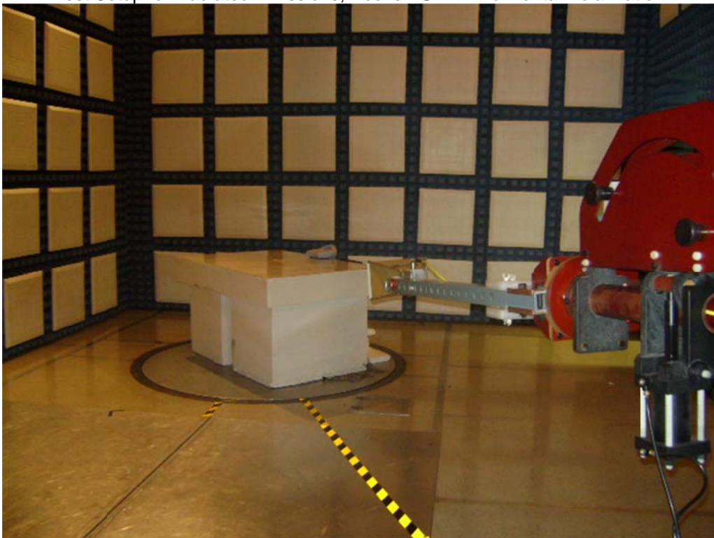
Test Setup for Radiated Emissions, Above 1GHz – Vertical Polarization