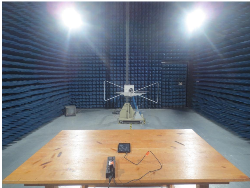
Radiated Spurious Emission