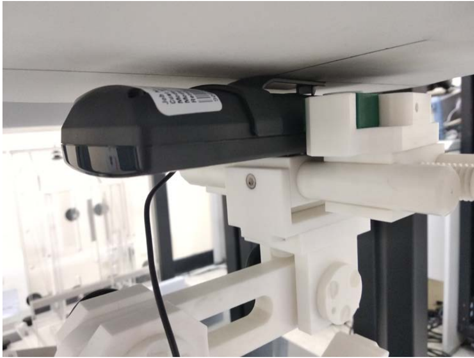
Figure 5 – Back surface with 0mm Separation