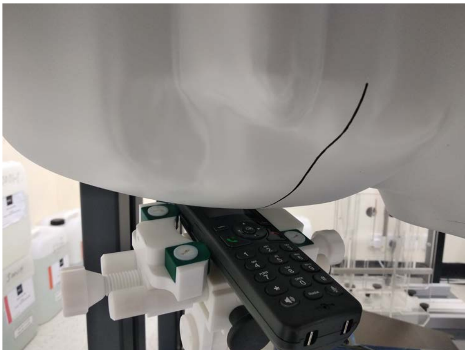
Figure 2 – Right Tilt