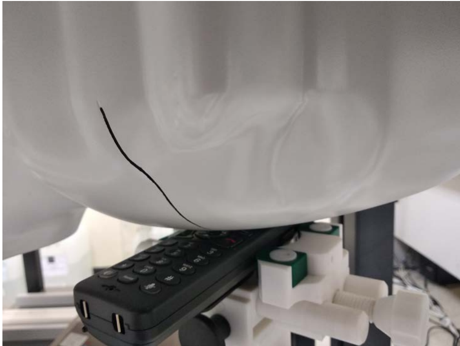
Figure 3 – Left Cheek