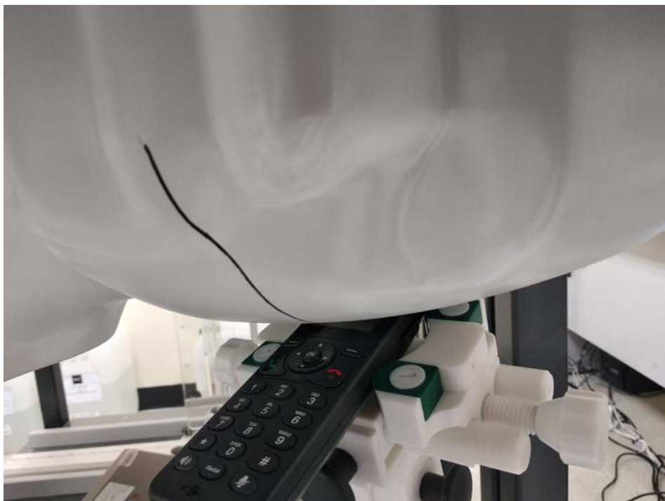
Figure 4 – Left Tilt