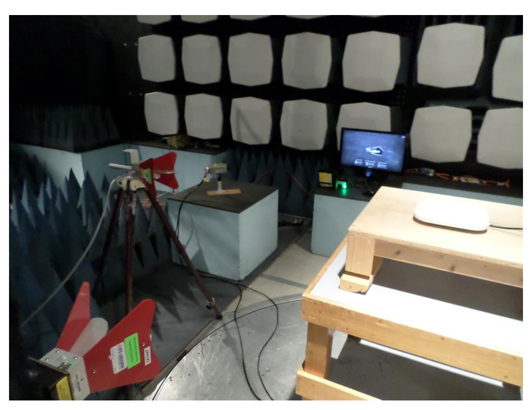
Photograph 4. DFS, Test Setup