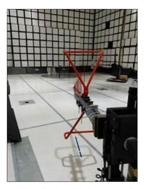
Photograph 1. Radiated Spurious Emissions, Below 1 GHz, Test Setup