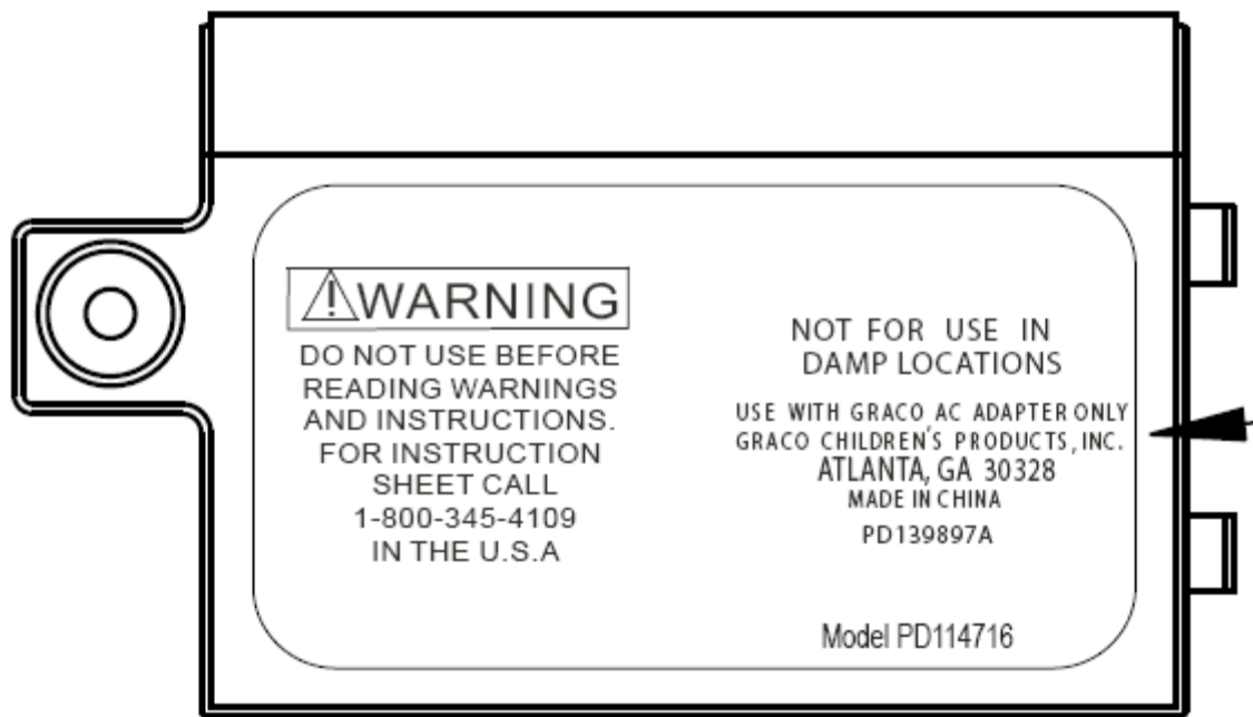
Figure 2: Sample Label 2 and Location