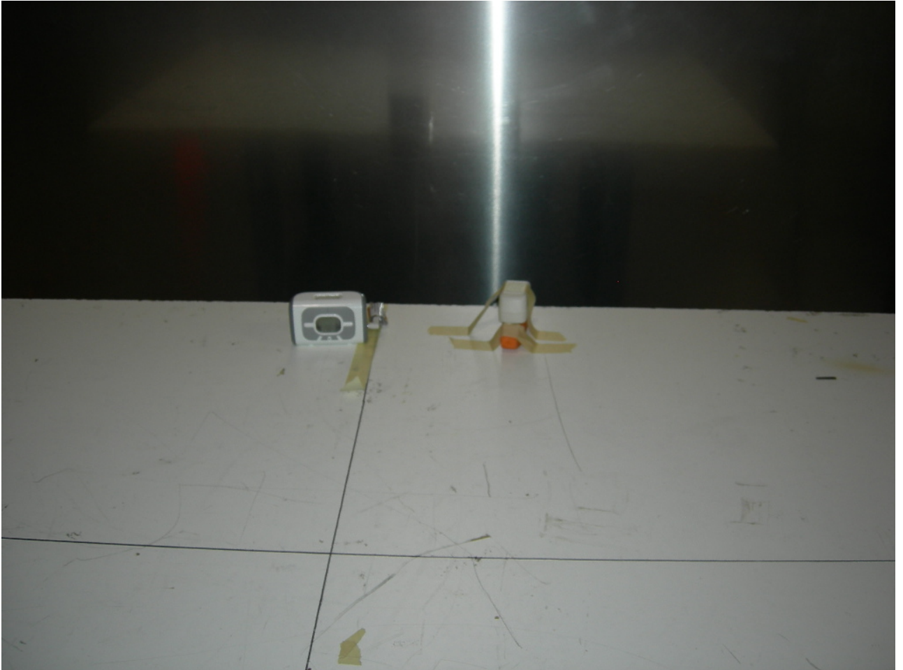
Figure 2: Conducted Emissions