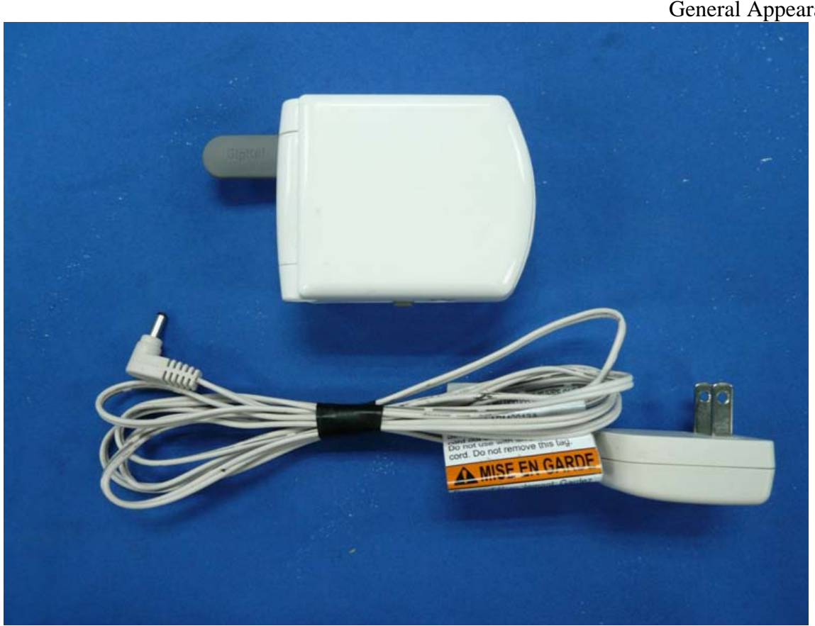
Figure 2 General Appearance