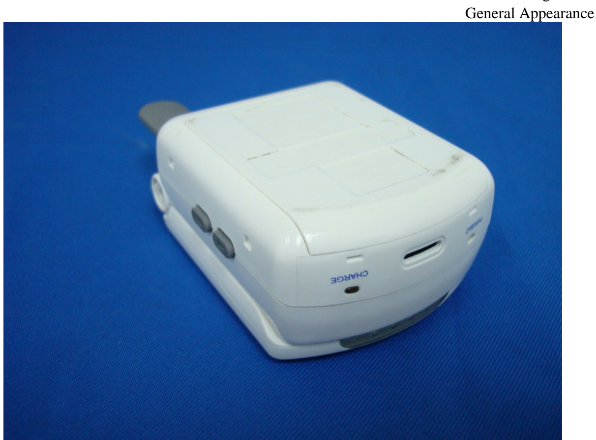
Figure 4 Adapter