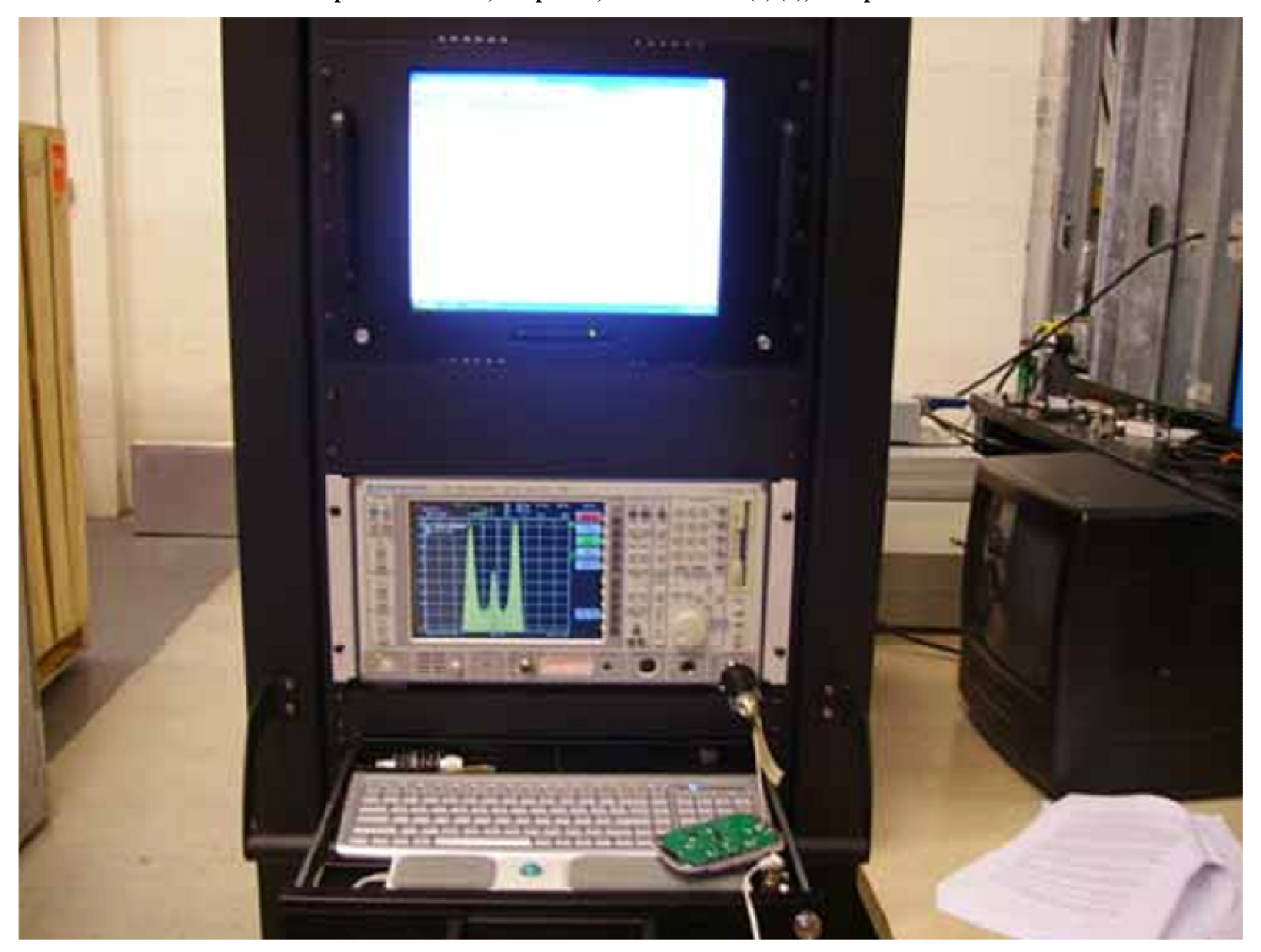
Test Setup – FCC Part 15, Subpart C, Section 15.247 (a) (2), Occupied Bandwidth