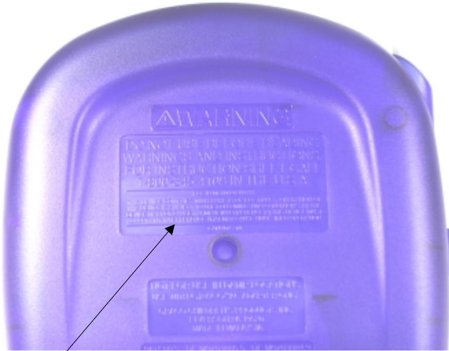
Physical Location Of Label On EUT (Transmitter rear)

The label shown will be permanently affixed at a conspicuous location on the device and be readily visible to the user at the time of purchase.