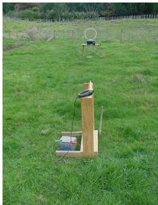
Below 30 MHz set up (Worst Case)