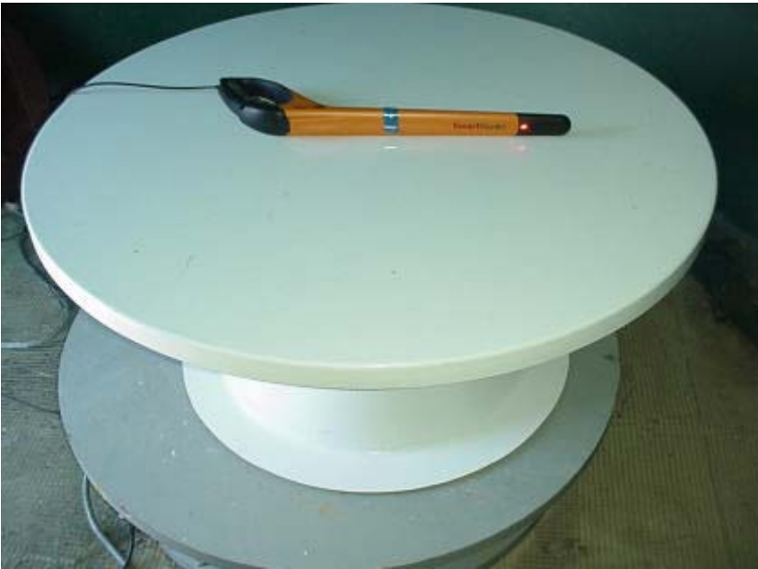
Conducted Emissions Test Set Up