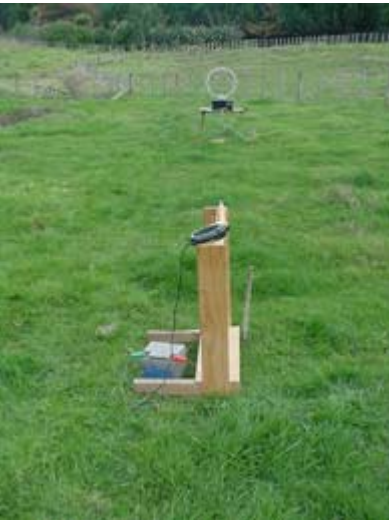
Below 30 MHz set up (Worst Case)