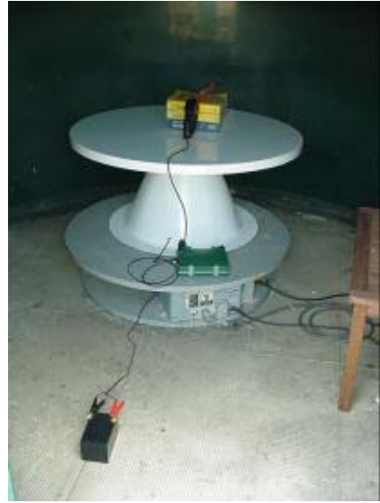
Weigh Scale Powered Test Set Up Laying Flat