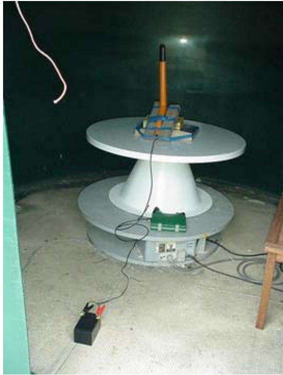
Laying Flat Test Set Up