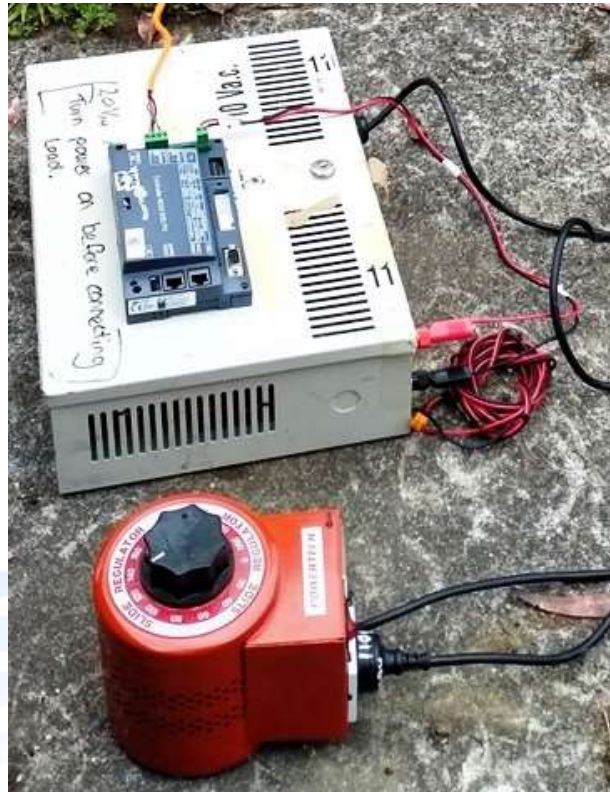
Radiated emissions test setup