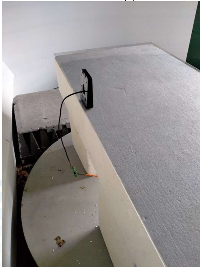
Test Antennas Used – Horn Antenna