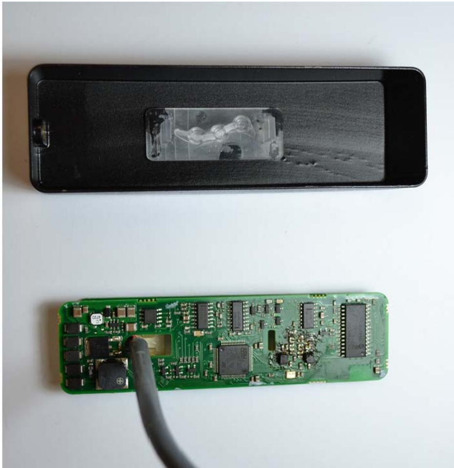
T15 Multi Tech - Front Cover and PCB Assembly