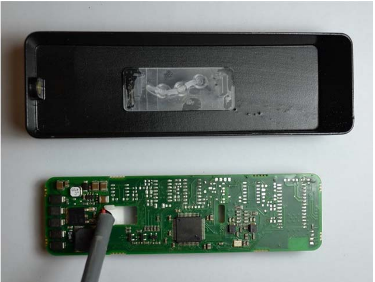
T15 Mifare - Front Cover and PCB Assembly