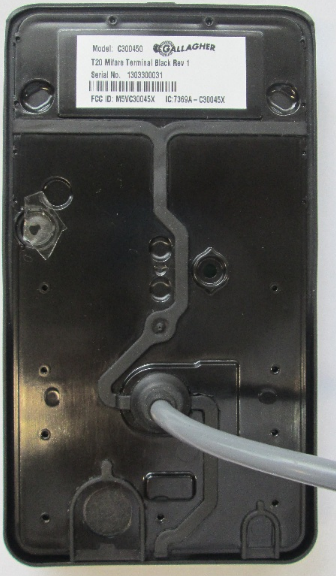
T20 Mifare - Product ID Label Location