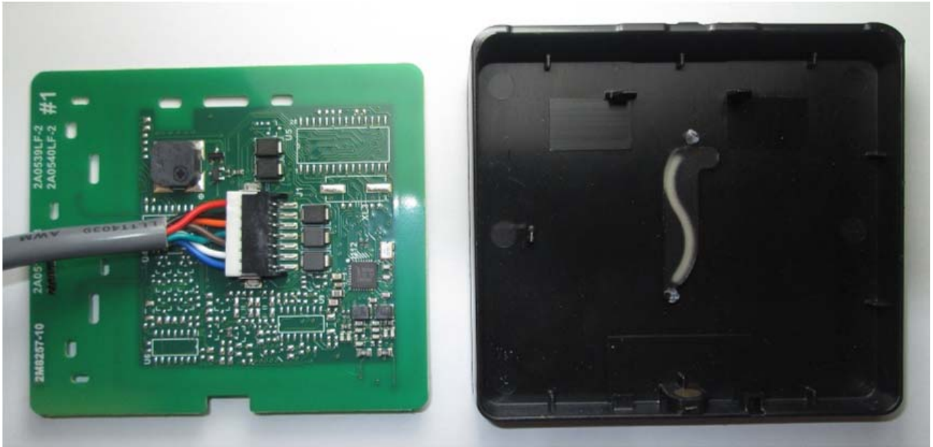
T12 Mifare - Front Cover and PCB Assembly