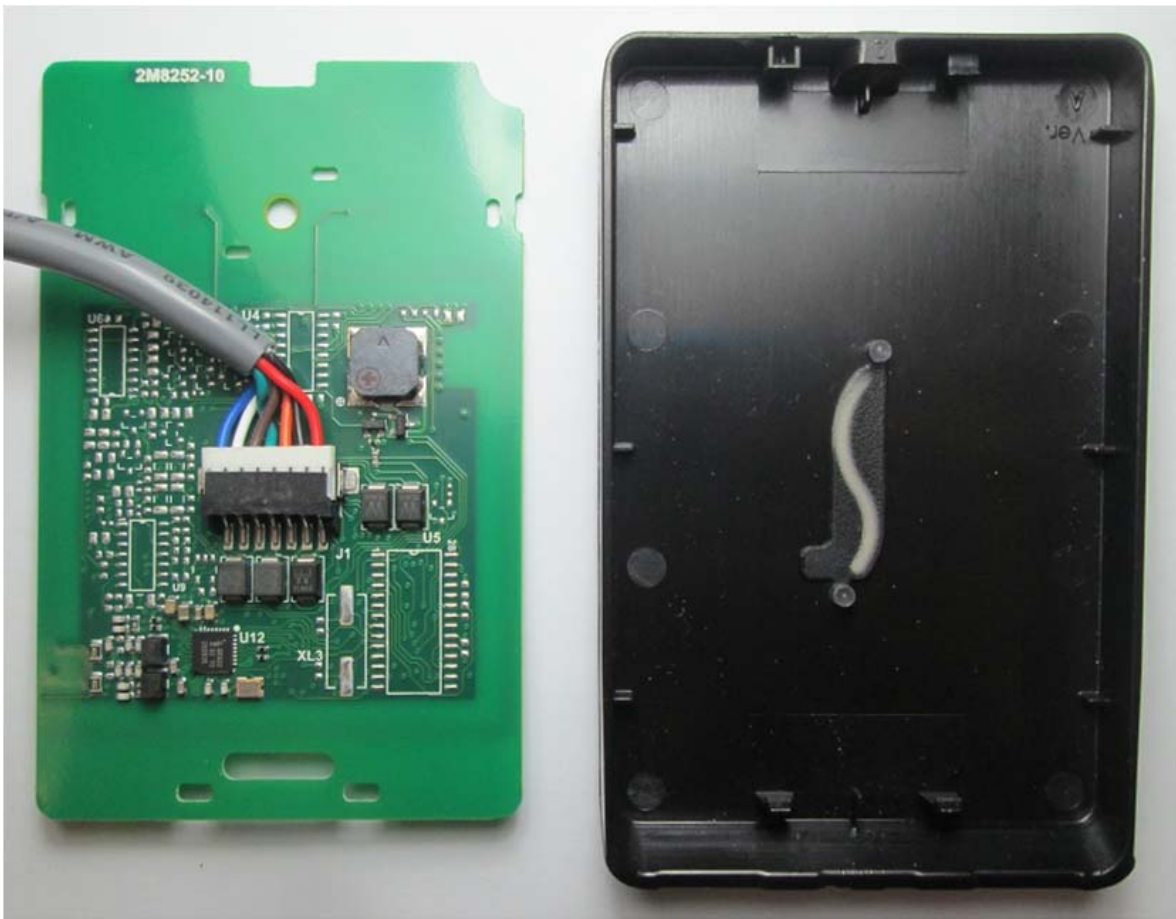
T11 Mifare - Front Cover and PCB Assembly