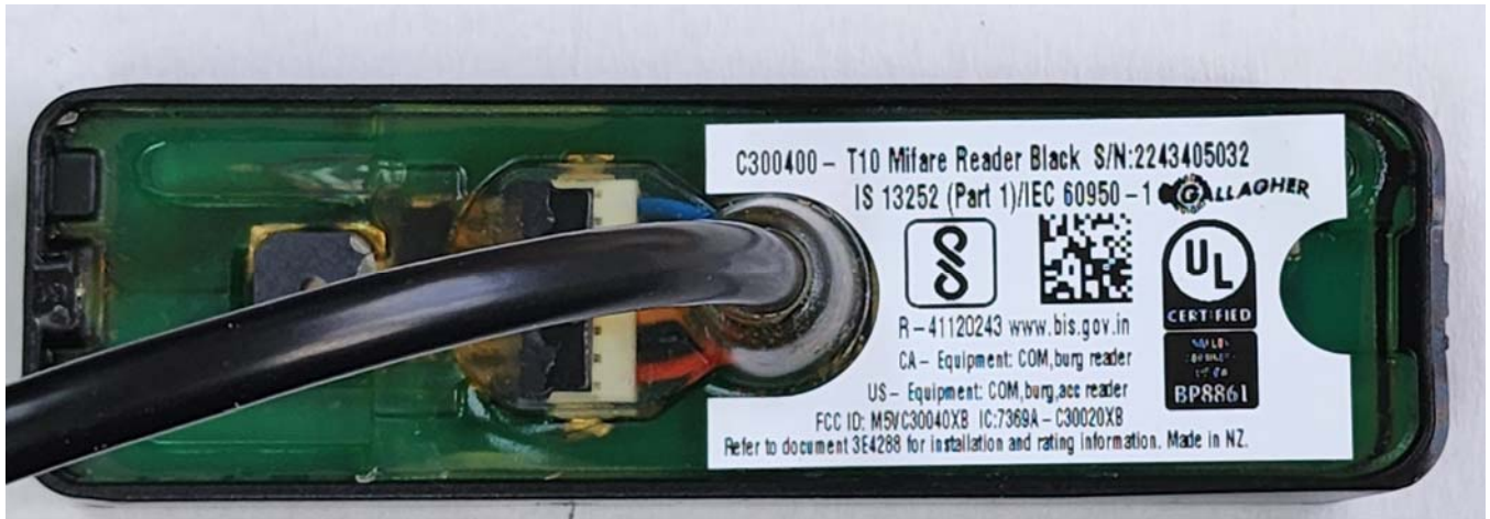
T10 Mifare - Product ID Label Location