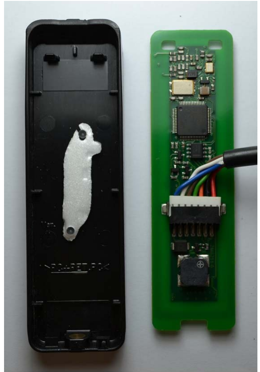
T10 Mifare - Front Cover and PCB Assembly