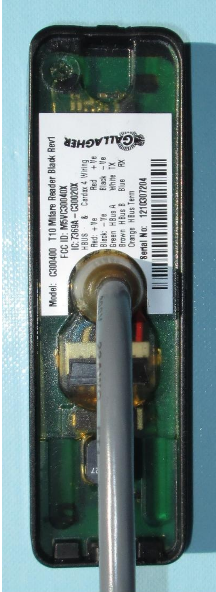
T10 Mifare - Potted Assembly