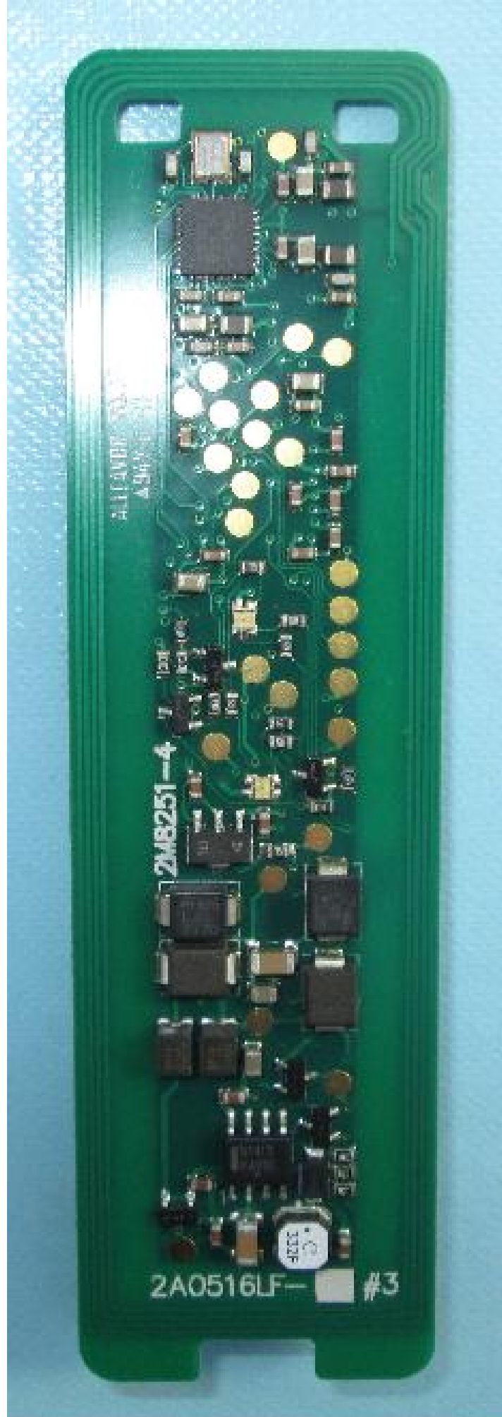
T10 Mifare - PCB (front side)